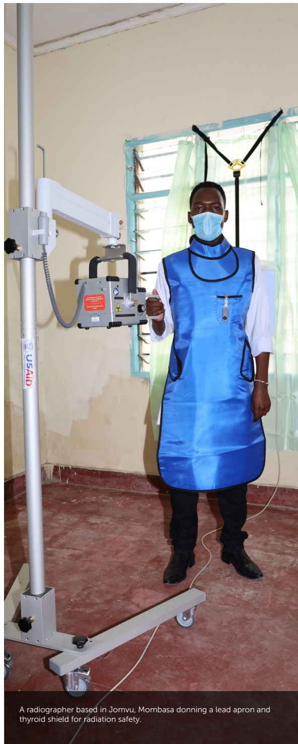
A radiographer based in Jomvu, Mombasa donning a lead apron and thyroid shield for radiation safety.

Additionally, prior to the roll-out of digital X-ray screening using CAD, an in-country national sub-committee spearheaded by the NTL-D-P was formed. This committee was instrumental in collaboratively planning and overseeing the compliance, safety and local adaptation of the project activities thereby demonstrating the need for inclusion of all stakeholders (national and county programs, nuclear authority, radiologists, radiographers and partners) early on.