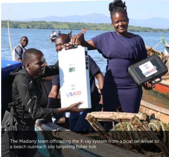
The Madiany team offloading the X-ray system from a boat on arrival to a beach outreach site targeting fisher folk

by variability in interpretation and a shortage of skilled radiologists in high-burden countries. These issues can lead to missed diagnoses and delayed treatment. The use of CAD software to detect TB-related abnormalities can significantly improve the accuracy and consistency of screening results. Additionally, the miniaturisation of digital X-ray technology into a portable form allows for TB screening services to be delivered to remote and hard-to-reach areas, increasing access to care and improving health outcomes for affected individuals.