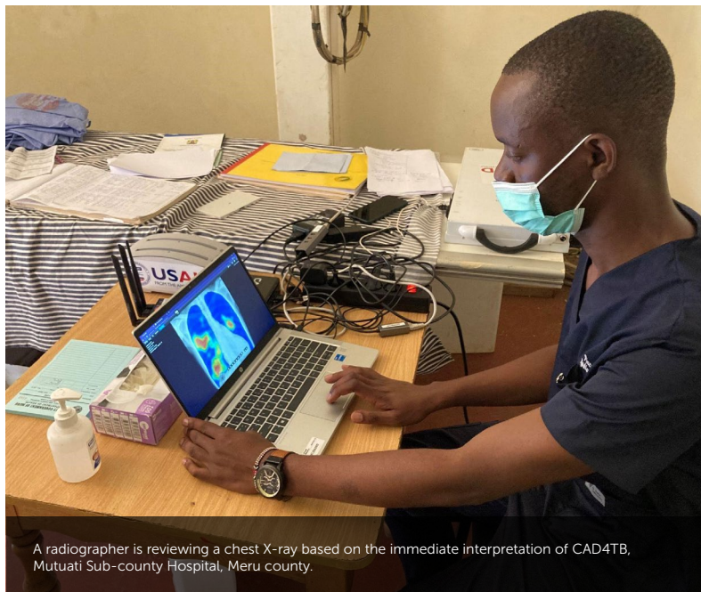
A radiographer is reviewing a chest X-ray based on the immediate interpretation of CAD4TB, Mutuati Sub-county Hospital, Meru county.